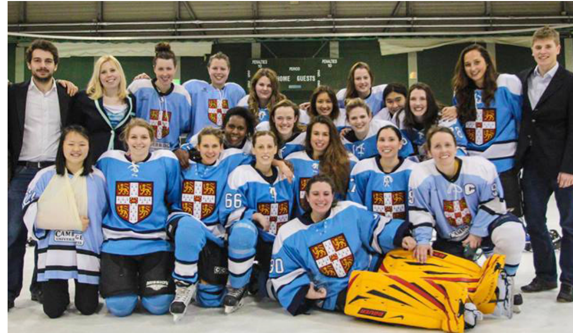
Women's Blues, Varsity Match, 2014.

Each year, the Men's Blues travel to the village of Zuoz in Swiss Alps for a week of intense training and preparation. This has been made possible through a recurring invitation from the Lyceum Alpinum Zuoz, a private boarding school with a reputation for both academic and sporting excellence. The tradition goes back to the start of the 20th century and is made possible by the mutually beneficial relationship between the CUIHC and the Lyceum, with the latter providing free use of their facilities and CUIHC members holding informal career talks for the Lyceum's students.