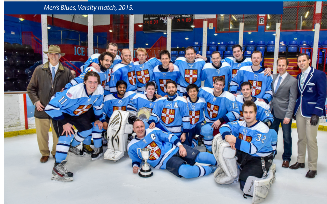
Men's Blues, Varsity match, 2015.